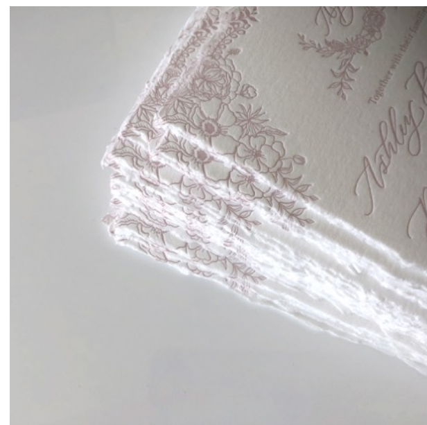
A "full-bleed" illustration off the deckled edge of a letterpress invitation