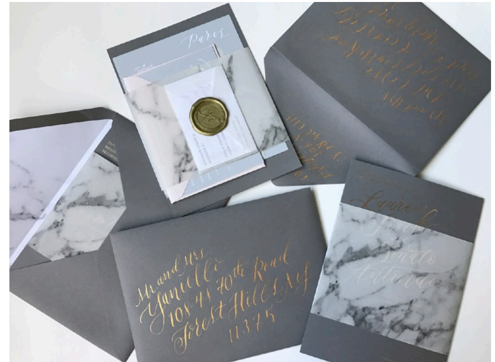
Golden Touch :: Gold foil is hot-pressed onto luxuriously thick pewter paper here, wrapped in a custom marble pattern vellum, and complemented by gold envelope calligraphy and a simple wax seal for a perfectly Parisian soirée