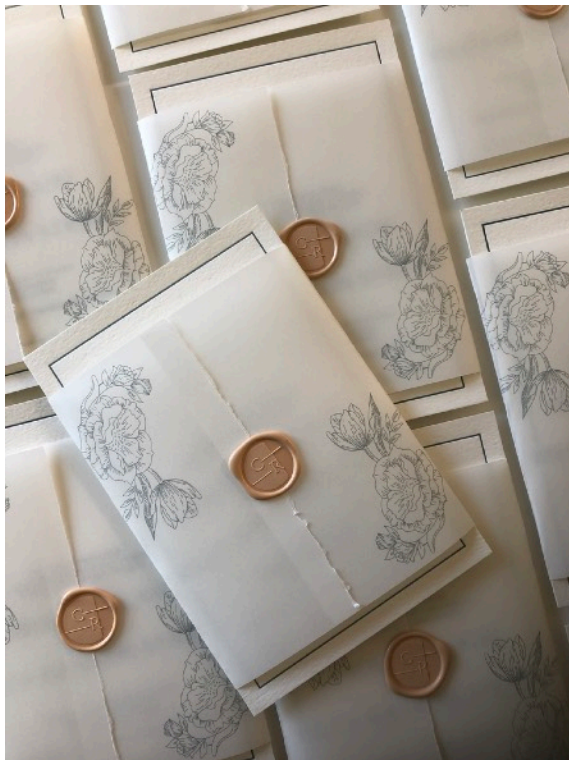
A hand torn edge to keep the cool-toned vellum wrap feeling warm