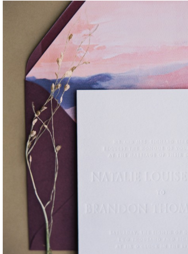
Blind impression letterpress