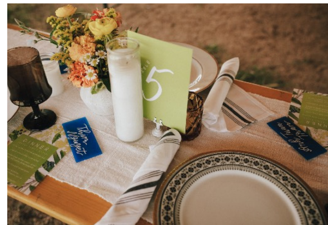
Menus + Table Numbers + Lucite Place Cards