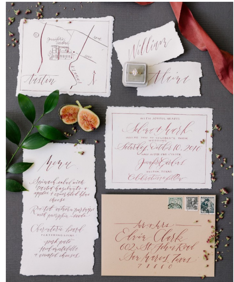
Old World Chic:: Deckled edges and a single ink color throughout brought old world elegance with a modern sensibility