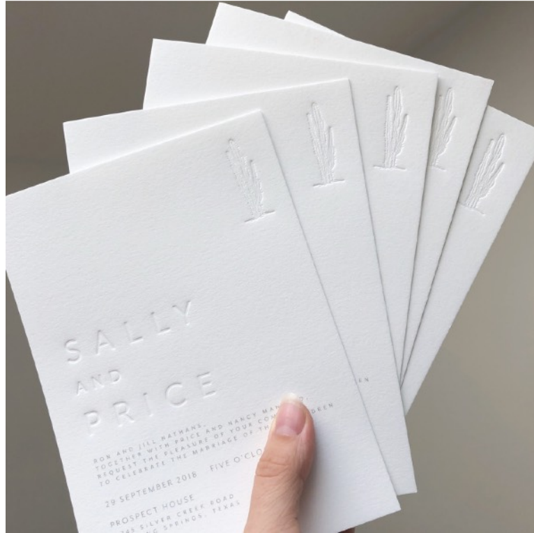
Blind Impression :: A version of letterpress printing where no ink is applied to the die. Best for bold headers + line drawn icons. Paired here with a digital print process to ensure a legible invitation on a perfectly squishy cotton paper.