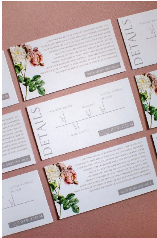
Including personal details