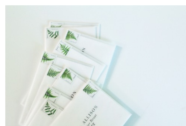
Transparent vellum reply envelopes