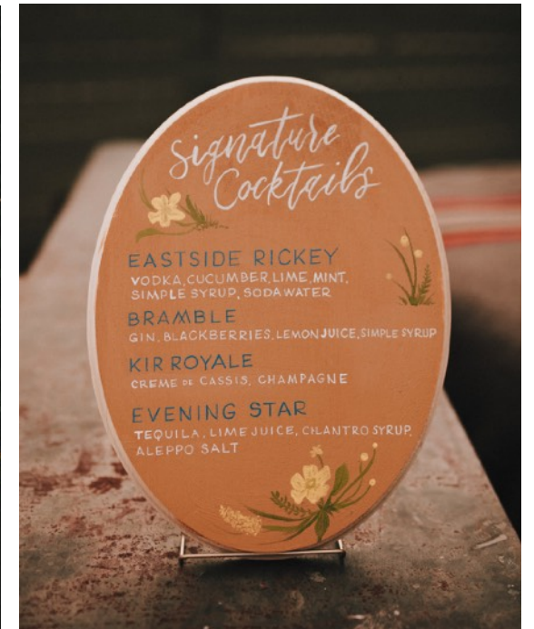
Hand-painted wooden bar menu