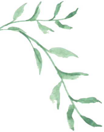
example of the style guide we create and provide

Then, sit back and wait for your friends + family to receive in the mail and prepare for all to be utterly delighted!