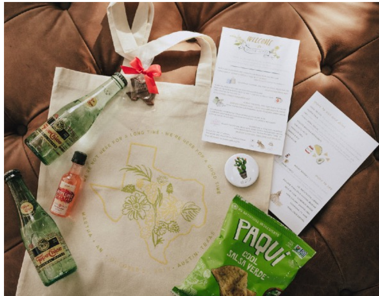
Welcome Notes + Totes