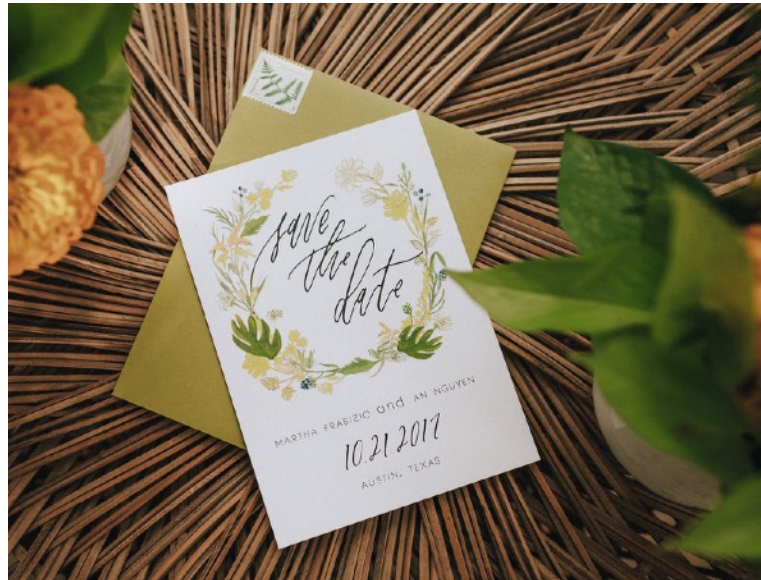
Save the Dates