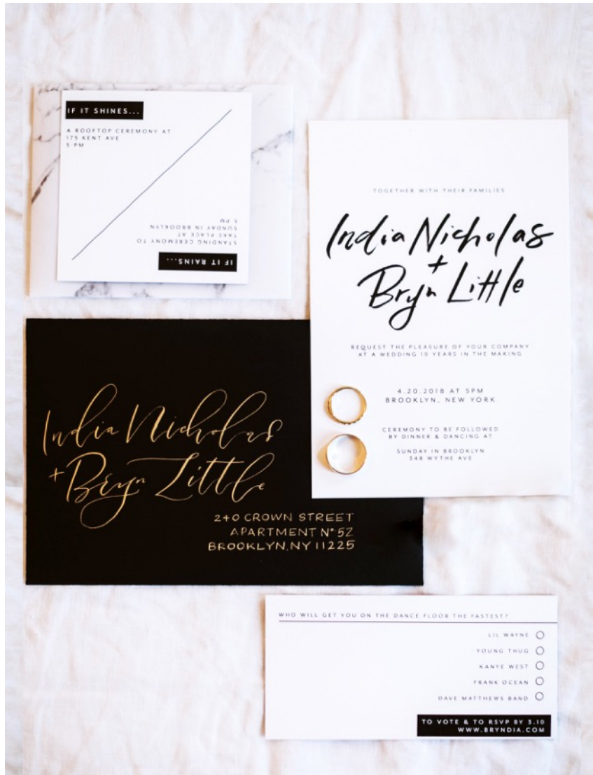
Effortless Cool :: This stylish Brooklyn couple went simple with a black, white, gold, and marble palette but stayed original and fresh with cheeky copy and unexpected shapes