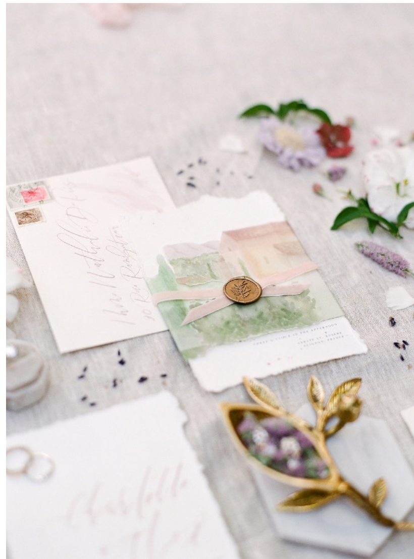
Provincial Romance :: This vellum wrap is a painting of the Abbaye St. Eusebe, site of a small elopement in the French countryside. Secured with blush velvet ribbon and a bronze wax seal bearing a spring of lavender in honor of the surrounding fields - hard to get any more romantic.