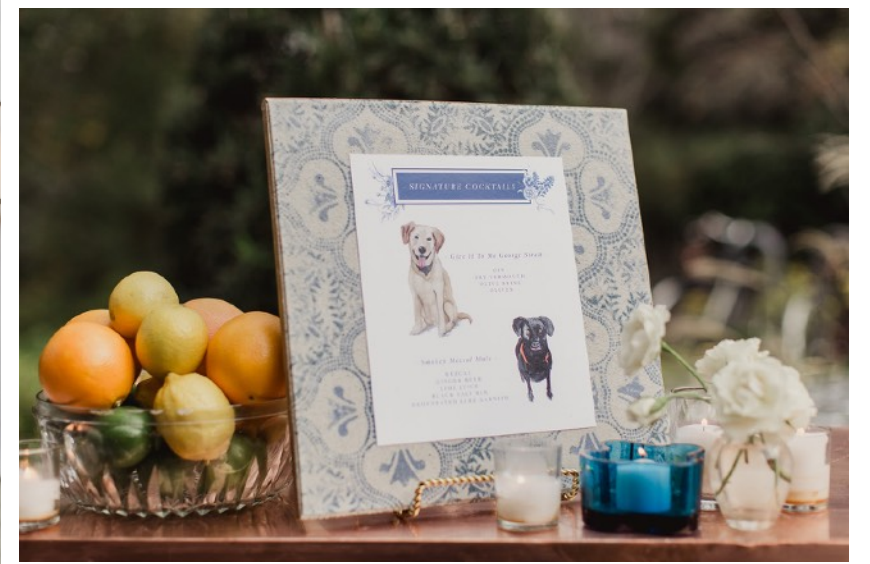
Pet Portrait Cocktail Sign