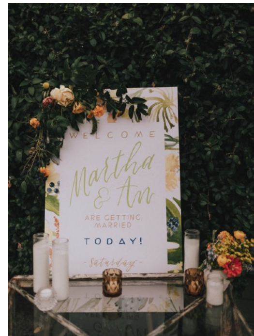
Large Format Welcome Sign